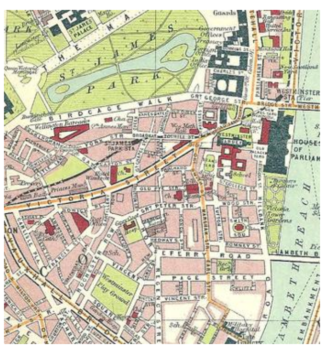
Figure 2: Map of Westminster from 1917 (Fernald, 2013)

In Mrs. Dalloway, London's story is made up of the personal stories of the novel's characters. The method of flânerie binds their activities together, providing experiences peculiar to each individual as they move through the streets of London. The experience of London, derived through these characters' movements, is dominated by symbols of authority, such as Westminster Abbey, Buckingham Palace and St Paul's Cathedral, and the sound of Big Ben (Seal, 2012b). The city provides an environment that enables exploration of the personal, cultural and literary lives of its people. Through narrative, Woolf describes London's physical features, depicting an environment that enforces separation between class, gender and social strata, each living in a different London based on their experiences as they move through the streets (Seal, 2012b) The art of walking the streets of London creates opportunities to experience the city first-hand as the characters encounter an urban environment full of life, with buses, cars, trains and people living their daily lives.