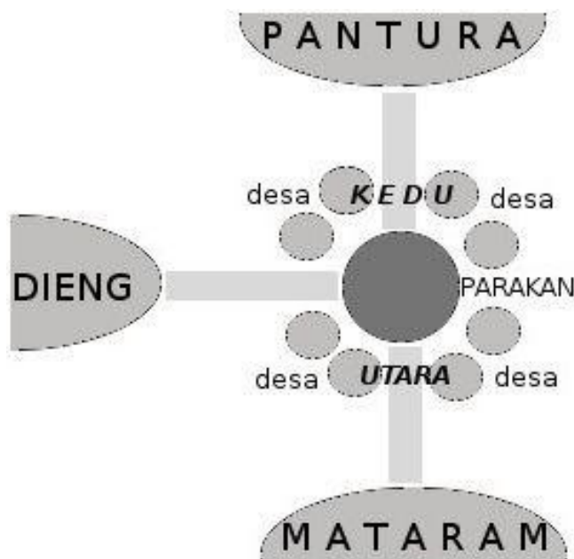
Figure 1. Location of Parakan in Central Java Source: Murtiyoso (2016)

Over time, Parakan has experienced significant physical and economic decline compared with surrounding cities. Its local government has been encouraged to restore it to its former glory through tourism by promoting its historical and cultural values. One of the most significant activities from the local community in collaboration with local government has been to propose Parakan as a heritage city, and the memorandum of understanding to this effect was declared and signed on 10 th December 2015 by Bupati Temanggung and the Minister of Pekerjaan, Umum dan Perumahan Rakyat.