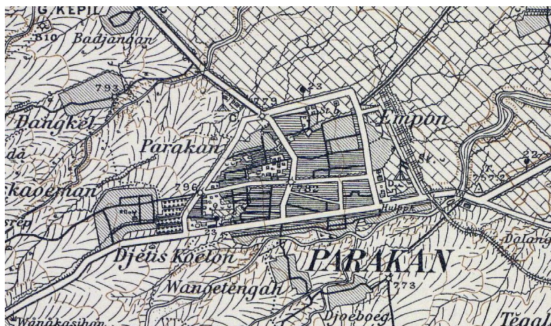
Figure 3. Map of Parakan in the Colonial Period (19th - 20th century)

culture of Parakan, which was known as the City of the Bamboo Runcing. The local community is very proud of the bamboo runcing and its history. It was introduced to Indonesian soldiers by the religionist K.H. Subkhi and became the traditional weapon of Indonesia. This historical aspect has led to emotional bonding and affection for this hero as a pioneer of the Bamboo Runcing. All members of the community of Parakan, whether native Indonesians, the Chinese community or “pendherek” or followers of Pangeran Diponegoro and their great-grand-children, have this historical attachment.